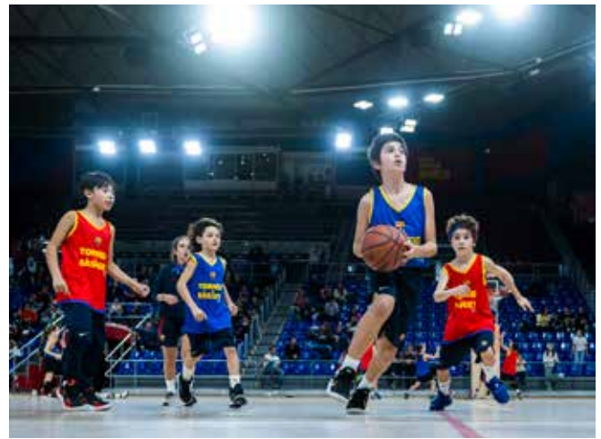
PHOTO WITH THE FIRST TEAMS

The Christmas Basketball Tournament for members was held for the fifth time at the Palau Blaugrana on the afternoon of 22 December. In addition to club members, members of the Amateur Sports and Basketball School, born between 2012 and 2015, were able to participate. The tournament was, as always, a unique opportunity to enjoy a 3x3 basketball tournament at the Palau Blaugrana.